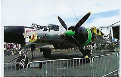
Rare P-61 Night Fighter