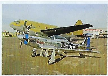
WWII Era Airplanes