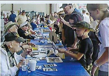
Talk to WWII Veterans

Let the sights and sounds transport you back to the 1940's and experience living history. Stroll around the encampments and witness what life was like in the field. More than 1,700 WWII military and civilian reenactors representing many nations, will be pleased to share their knowledge and passion.